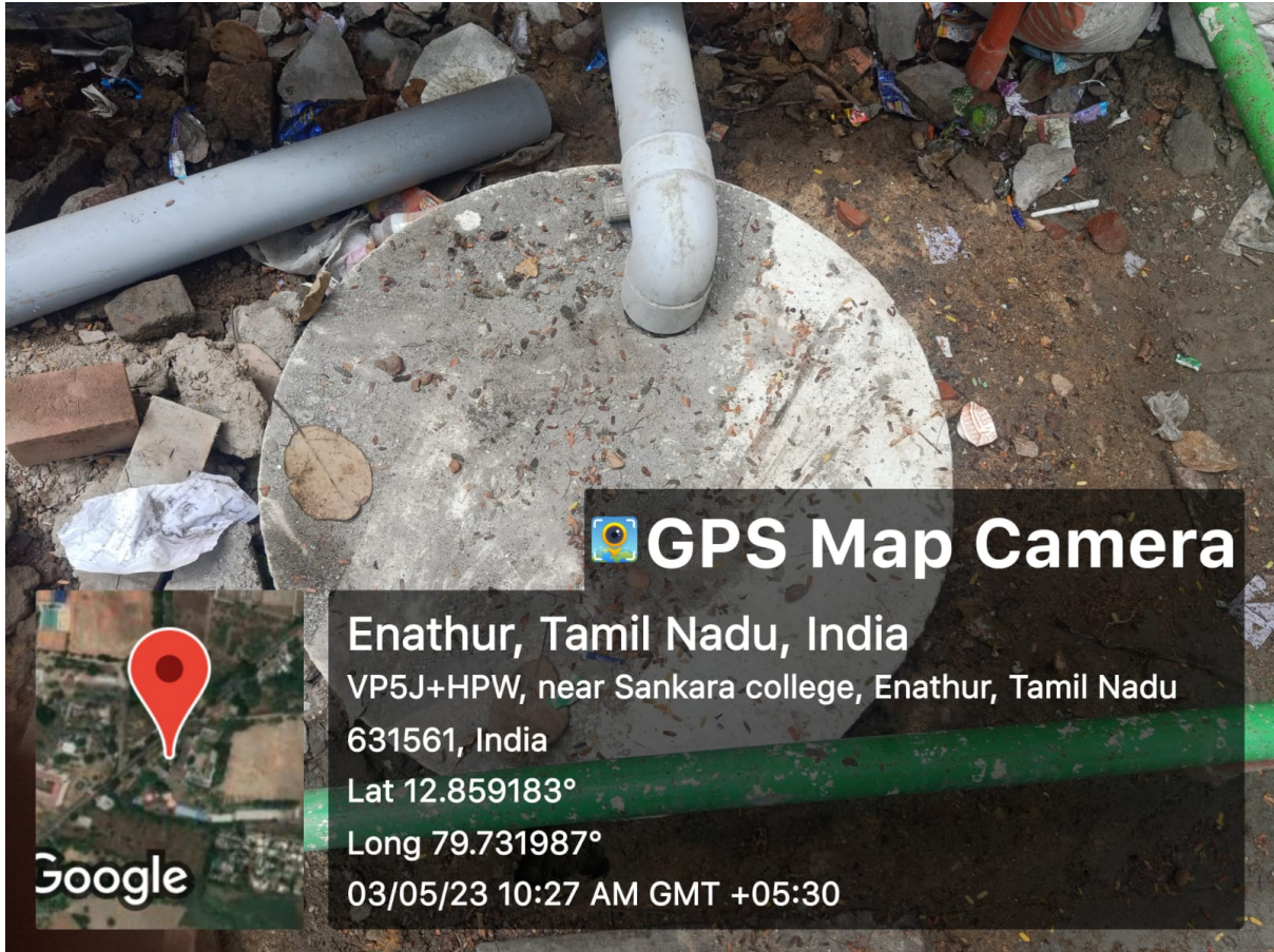
RAIN WATER HARVESTING IN J BLOCK